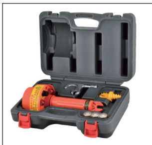
• Carry case