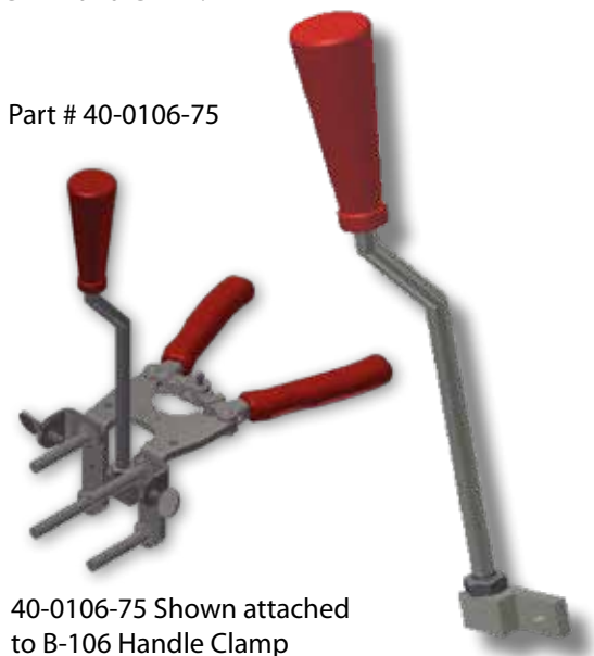
40-0106-75 Shown attached to B-106 Handle Clamp