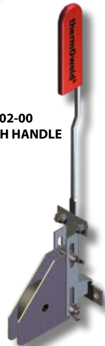
Part # 40-7202-00 SHOWN WITH HANDLE

The PK-3 integral magnetic clamp is adaptable to all thermOweld® price key 3 molds. A strong, 48 lb. magnet holds the mold in place and prevents leakage. Works on both cast iron and steel and can be used to weld to both pipe as well as flat surfaces. Designed for remote welding, using our thermOweld® EZ Lite Remote® ignition system. See page 232 for more information.