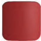
Locking Button Top View