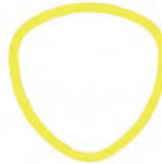
End View showing Triangular Shape