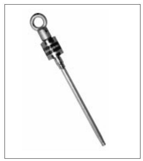
Figure 4. Insert installation torque tool.