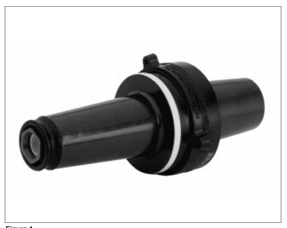
Loadbreak Bushing Insert with latch indicator ring and "All Copper Current Path" for application in transformers, switches and other apparatus.

No special tools are necessary. The insert can be installed by hand or with the assistance of a torque tool. Using the hex-broached base (see Figure 2) and the optional Installation Torque Tool, consistent installation can be easily achieved. Refer to Installation Instruction Sheet S500-12-1 for details.