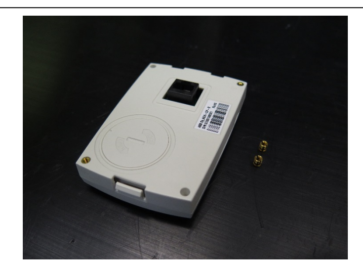
1. Have a panel and two inserts.