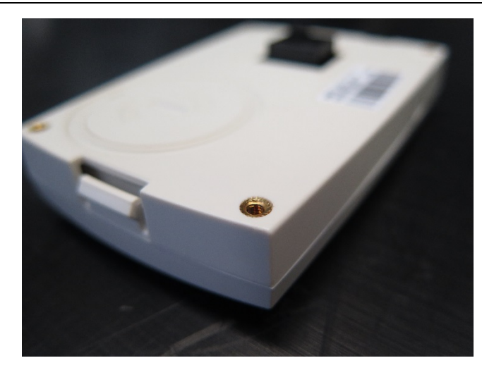
4. Make sure the insert is in level with the panel's back cover