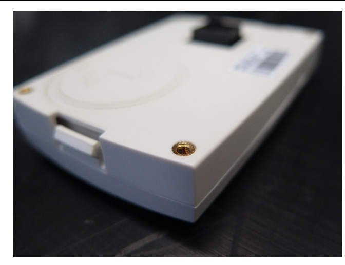
4. Push the insert into the hole with the hot soldering iron. Make sure the insert is in level with the panel's back cover