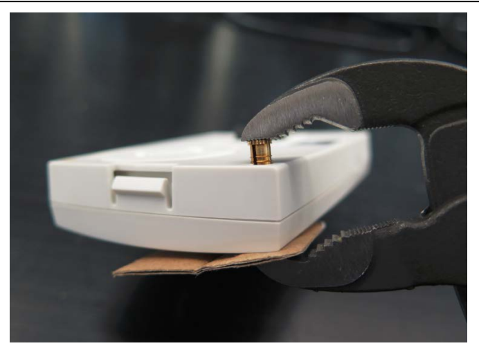
3. Cover the front of the panel and squeeze the insert into the panel with pliers.