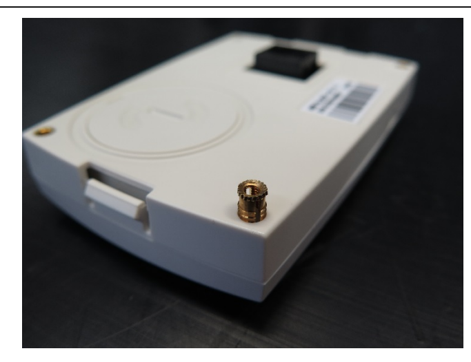
2. Place the insert to the hole.