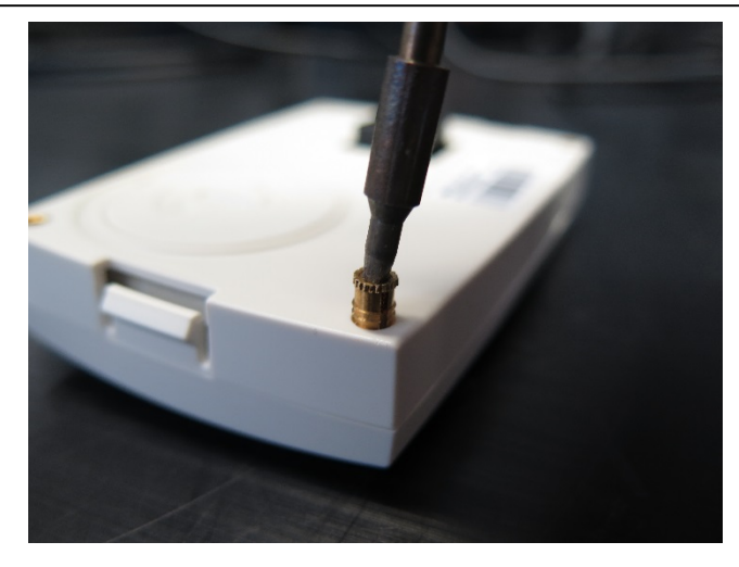
3. Heat the soldering iron to 350°C and heat the insert for two seconds.