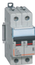
4 078 02